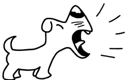
A dog can bark.